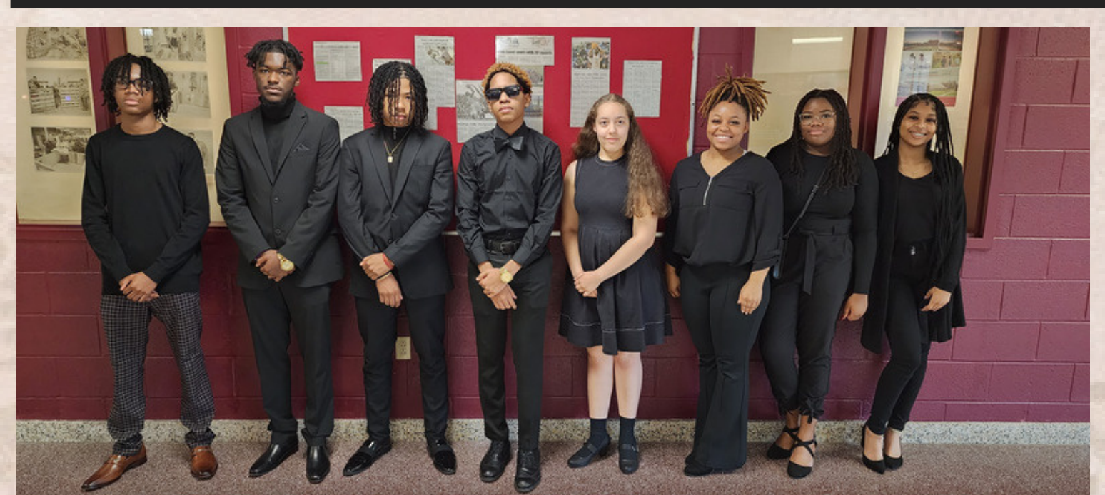
The Original King's Fork Model United Nations Delegation, the First-Ever from Suffolk Public Schools